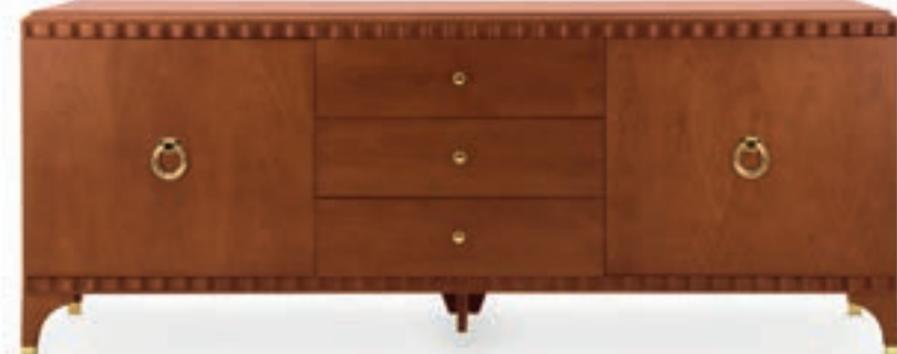
2 DOORS SIDEBOARD WITH DRAWERS

Art. 00CO351 Finish: O6 - English mahogany - cat. ZB Standard: metal tip legs included W. 228 D. 53 H. 96