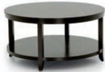
KYLINDO COFFEE TABLE