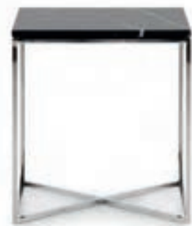
KLEPSIDRA LAMP TABLE

Marble top: Carrara white Metal base: Chrome W. 130 D. 80 H. 40