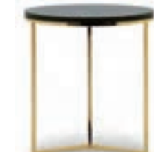
TRIO LAMP TABLE

Marble top: Emperador dark Metal base: Gold plated W. 80 D. 80 H. 41