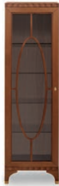
LEFT OPENING GLASS CASE