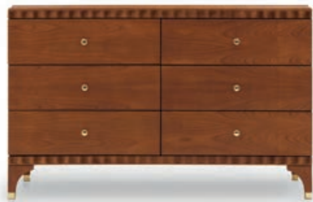
CHEST OF DRAWERS

Finish: MC - Modern cherry - Cat. ZE Metal tips leg: Gold plated W. 140 D. 55 H. 130