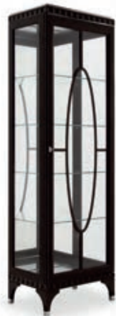
RIGHT OPENING GLASS CUPBOARD

Finish: O6 - English mahogany - cat. ZB Standard: metal tip legs included W. 111 D. 42 H. 221