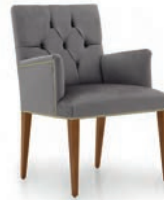
ARIANNA SMALL ARMCHAIR