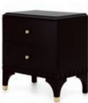
2 DRAWERS NIGHTSTAND

Finishing: P3 - Moka - Cat. ZA Upholstery: Combination H69 - Cat. B Optional: Quilted design on the headboard not included Standard: metal tip legs included Note: Mattress sizes 180 x 200 W. 193 D. 216 H. 145