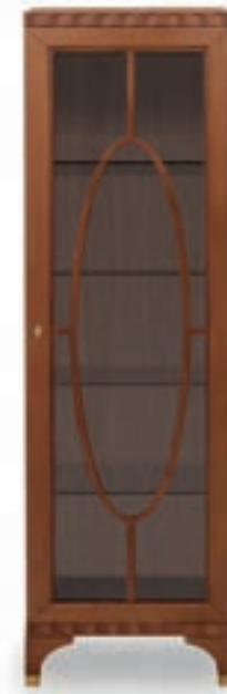
RIGHT OPENING GLASS CASE

Finish: MC - Modern cherry - Cat. ZE Standard: Metal tips leg W. 70 D. 42 H. 221