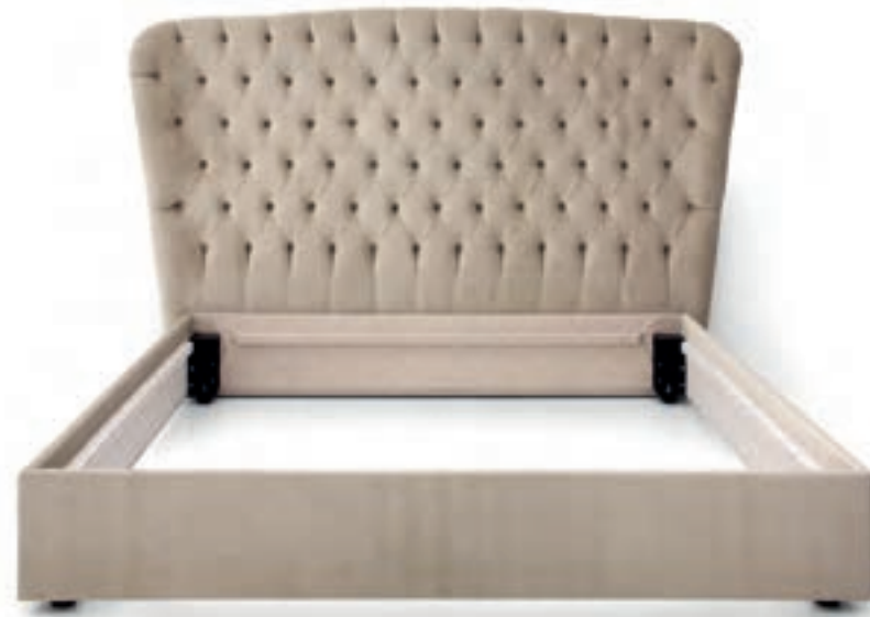
FOLD DOUBLE BED