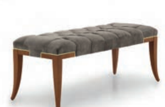
IDRA UPHOLSTERED BENCH

Upholstery: Fabric LJK - Cat. B W. 51 D. 51 H. 50