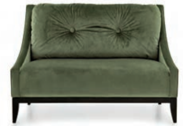
DOROTEA 2 SEATER SOFA

Finish: P3 - Moka - Cat. ZA Upholstery: Fabric M4Z - Cat. C Trimmings: Self piping Standard: Loose cushion included W. 72 D. 85 H. 89