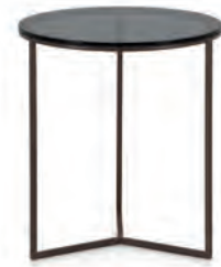
TRIO LAMP TABLE

Finish: MC - Modern cherry - Cat. ZE Upholstery: Combination H49 LF6+AD2 - Cat. B Trimmings: Self piping Standard: Buttons on the back included W. 230 D. 84 H. 80