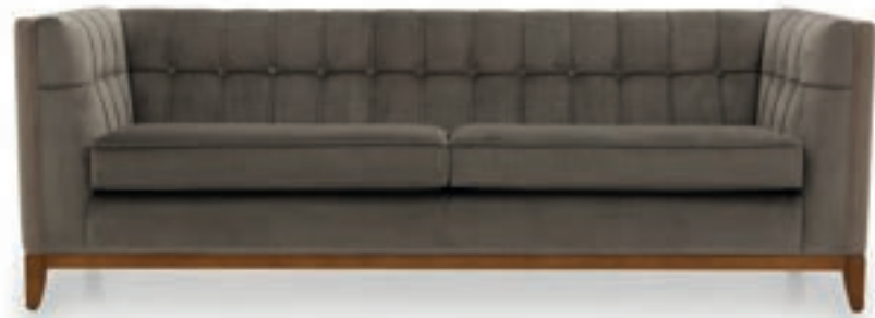
LIXIS 4 SEATER SOFA