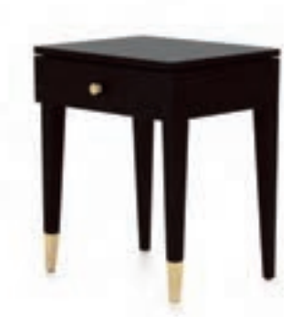
LOOK SINGLE DRAWER NIGHTSTAND

Finish: P3 - Moka - Cat. ZA Upholstery: Fabric LRW - Cat. B Optional: Quilted design on the headboard not included W. 120 D. 9,5 H. 150