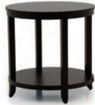
KYLINDO LAMP TABLE

Finish: WE - Wengé - Cat. ZE W. 90 D. 90 H. 45,5