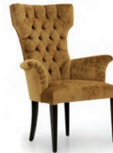
QUEEN SMALL ARMCHAIR

Finish: P3 - Moka - Cat. ZA Upholstery: Combination J07 M83+E98 - Cat. D Trimmings: Self piping W. 53,5 D. 60 H. 90