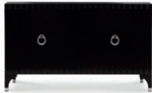
2 DOORS SIDEBOARD

Art. 00CR356 Finish: O6 - English mahogany - cat. ZB Standard: metal tip legs included W. 152 D. 59 H. 91