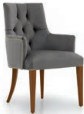
OLIMPIA SMALL ARMCHAIR

Finish: SG - Spring grey - Cat. ZD Upholstery: Fabric BXS - Cat. B Trimmings: J - Silver nails Optional: Chrome tip legs not included W. 49 D. 59 H. 97,5