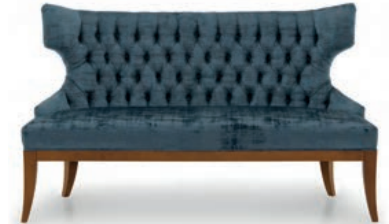
IRENE 2 SEATER SOFA

Finish: MC - Modern cherry - Cat. ZE Upholstery: Fabric LFS - Cat. B Trimmings: Self piping Standard: Tufted back included W. 77 D. 72 H. 86