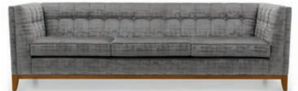
LIXIS 5 SEATER SOFA

Finish: MC - Modern cherry - Cat. ZE Upholstery: Fabric LJJ - Cat. B Trimmings: Self piping W. 96 D. 81 H. 51