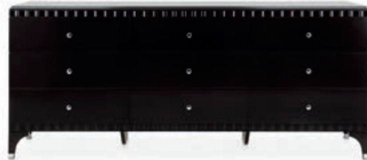
9 DRAWERS SIDEBOARD

Art. 00CR357 Finish: P3 - Moka - cat. ZA W. 152 D. 59 H. 91