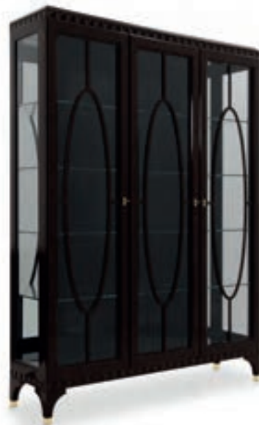
3 DOORS GLASS CUPBOARD

Finish: WE - Wengé - Cat. ZE Standard: Metal tips leg W. 111 D. 42 H. 221