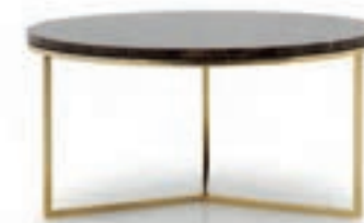
TRIO COFFEE TABLE

Marble top: Emperador light Metal base: Gold plated W. 55 D. 55 H. 60