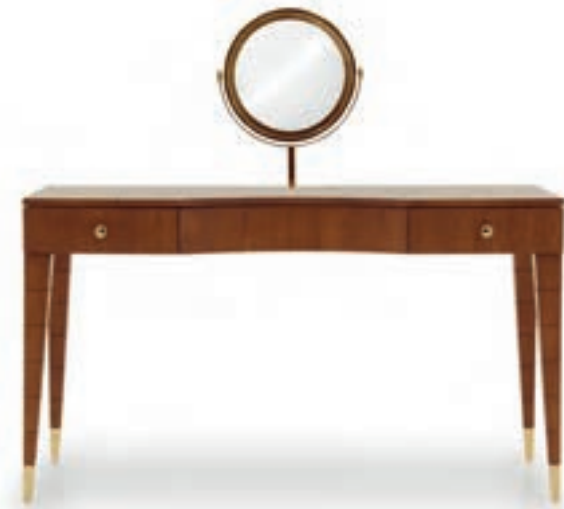
LOOK DRESSING TABLE WITH SWIVEL MIRROR

Finish: MC - Modern cherry - Cat. ZE Metal tips leg: Gold plated W. 140 D. 55 H. 80