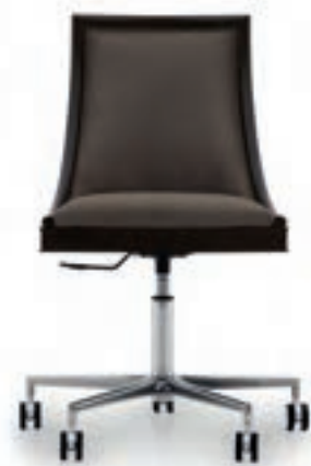
AMINA SWIVEL CHAIR

Finish: WE - Wengé - Cat. ZE Upholstery: Fabric DAH - Cat. D Trimmings: F - Shaded nails Standard: Round handle on the back included Optional: Tufted back not included W. 46 D. 56 H. 95