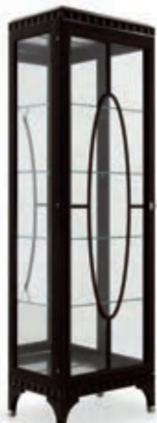
LEFT OPENING GLASS CUPBOARD

Finish: P3 - Moka - cat. ZA Standard: metal tip legs included Optional: mirror back not included W. 167 D. 42 H. 221