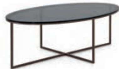
TRIO COFFEE TABLE

Upholstery: Fabric MA2 - Cat. C Standard: Loose cushions #CUS59 included W. 230 D. 100 H. 84