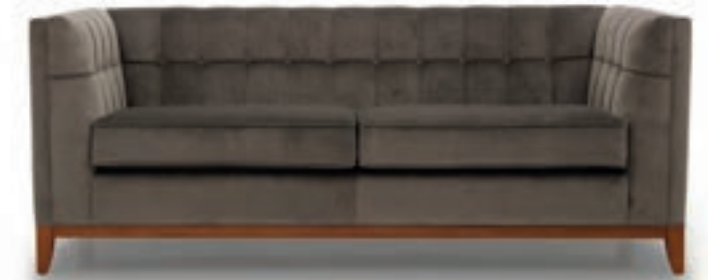
LIXIS 3 SEATER SOFA

Finish: MC - Modern cherry - Cat. ZE Upholstery: Fabric AD3 - Cat. A Trimmings: Self piping Standard: Buttons on the back included W. 95 D. 80 H. 80