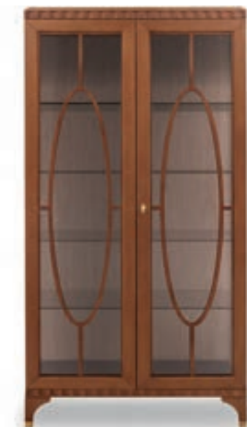
2 DOORS DISPLAY CABINET GLASS SIDE PANELS

Art. 00VE350 Finish: MC - Modern cherry - Cat. ZE Standard: Metal tips leg W. 111 D. 42 H. 221