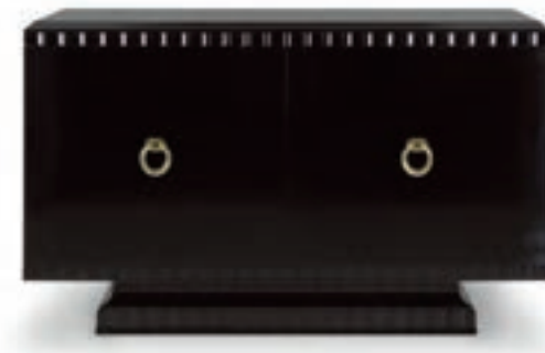
2 DOORS SIDEBOARD

Art. 00CR356 Finish: O6 - English mahogany - cat. ZB Standard: metal tip legs included W. 152 D. 59 H. 91