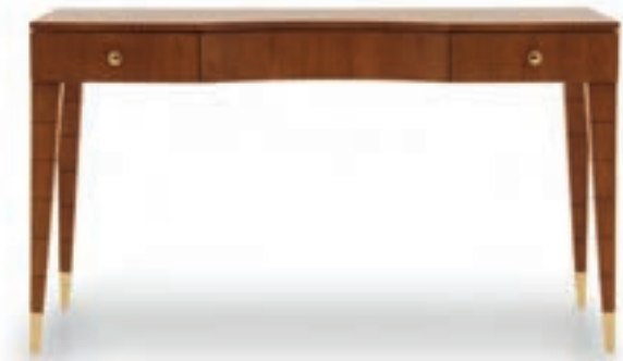
LOOK DRESSING TABLE