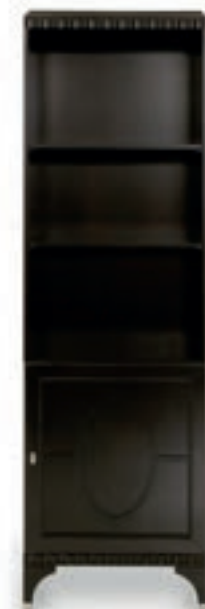
RIGHT OPENING BOOKCASE

Finish: WE - Wengé - Cat. ZE Standard: Metal tips leg W. 70 D. 42 H. 221