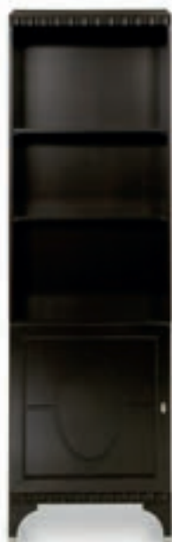
LEFT OPENING BOOKCASE

Finish: MC - Modern cherry - Cat. ZE Standard: Extensions 2 x 50 cm included Metal tips leg: Gold plated W. 222 D. 112 H. 78