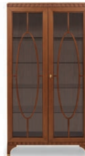
2 DOOR GLASS CASE

Art. 00CR352 Finish: MC - Modern cherry - Cat. ZE W. 220 D. 55 H. 85