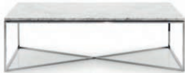
KLEPSIDRA COFFEE TABLE

Finish: MC - Modern cherry - Cat. ZE Upholstery: Fabric LF6 - Cat. B Trimmings: Self piping Standard: Buttons on the back included W. 200 D. 84 H. 80