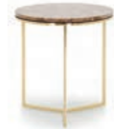
TRIO LAMP TABLE

Finish: P3 - Moka - cat. ZA Upholstery: Fabric ANS - Cat. A Trimming: Self piping Standard: Buttons on the back included W. 230 D. 82 H. 80 SH. 51 AH. 80