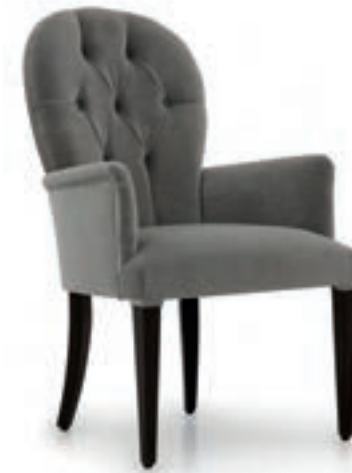
CALIPSO SMALL ARMCHAIR