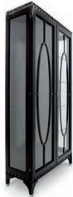
2 DOORS GLASS CUPBOARD